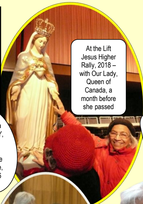
At the Lift Jesus Higher Rally, 2018 – with Our Lady, Queen of Canada, a month before she passed