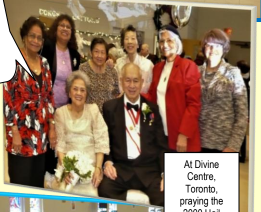
At Divine Centre, Toronto, praying the 2000 Hail Marys before the Blessed Sacrament