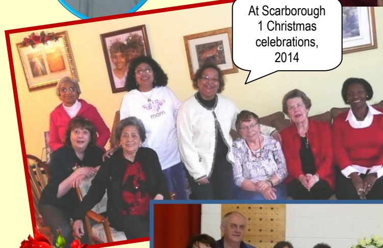
At Scarborough 1 Christmas celebrations, 2014