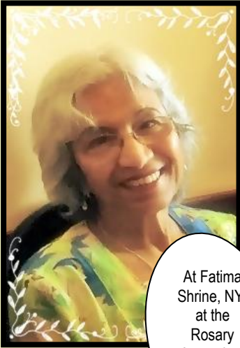
At Fatima Shrine, NY, at the Rosary Apostolate pilgrimage, Oct. 2016